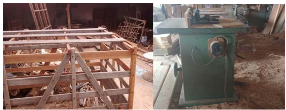
Figure 4 – Workplace

Another aspect analyzed was the organization of the workplace, considering that this factor has great impacts on the well-being and safety of the workers due to the lack of organization being a propeller to increase the accident rates. In this way, Figure 4 shows the environment where the activities are developed.